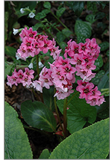
Pink Dragonfly Bergenia flowers