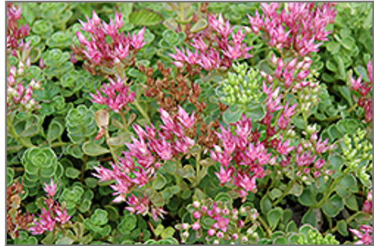
John Creech Stonecrop flowers

John Creech Stonecrop is recommended for the following landscape applications;