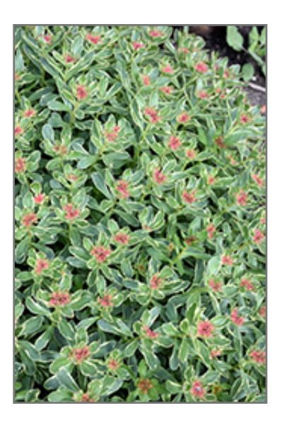
Variegated Russian Stonecrop foliage