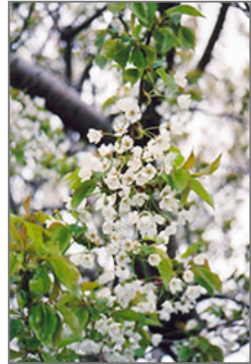
Sweet Cherry flowers

Sweet Cherry is covered in stunning clusters of fragrant white flowers hanging below the branches in early spring before the leaves. It has dark green deciduous foliage. The pointy leaves turn yellow in fall. The fruits are showy red drupes carried in abundance in mid summer. The fruit can be messy if allowed to drop on the lawn or walkways, and may require occasional clean-up. The smooth dark red bark adds an interesting dimension to the landscape.