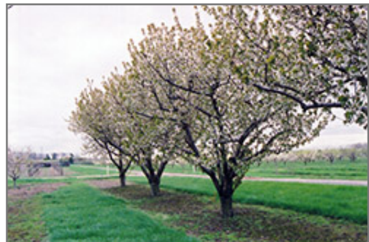
Sweet Cherry in bloom