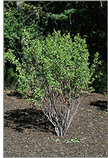
Rainbow Pillar Serviceberry

Rainbow Pillar Serviceberry is a dense multi-stemmed deciduous shrub with a narrowly upright and columnar growth habit. Its relatively fine texture sets it apart from other landscape plants with less refined foliage.