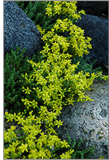
Six Row Stonecrop flowers