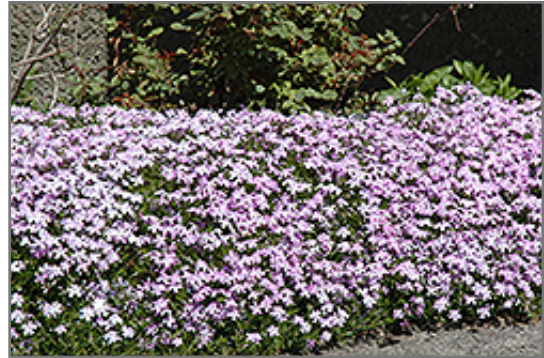
Emerald Blue Moss Phlox in bloom

Emerald Blue Moss Phlox will grow to be only 4 inches tall at maturity, with a spread of 18 inches. When grown in masses or used as a bedding plant, individual plants should be spaced approximately 15 inches apart. Its foliage tends to remain low and dense right to the ground. It grows at a medium rate, and under ideal conditions can be expected to live for approximately 10 years. As an evergreen perennial, this plant will typically keep its form and foliage year-round.