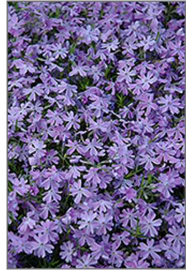
Emerald Blue Moss Phlox flowers

Emerald Blue Moss Phlox is recommended for the following landscape applications;