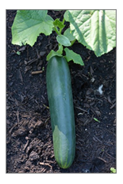
Straight Eight Cucumber fruit

Straight Eight Cucumber will grow to be about 8 inches tall at maturity, with a spread of 5 feet. When planted in rows, individual plants should be spaced approximately 24 inches apart. This vegetable plant is an annual, which means that it will grow for one season in your garden and then die after producing a crop.