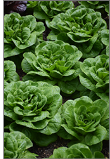
Buttercrunch Lettuce

Buttercrunch Lettuce will grow to be about 12 inches tall at maturity, with a spread of 6 inches. When planted in rows, individual plants should be spaced approximately 8 inches apart. This vegetable plant is an annual, which means that it will grow for one season in your garden and then die after producing a crop. Because of its relatively short time to maturity, it lends itself to a series of successive plantings each staggered by a week or two; this will prolong the effective harvest period.