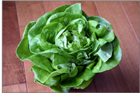
Buttercrunch Lettuce