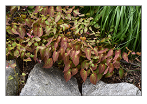
Bishop's Hat