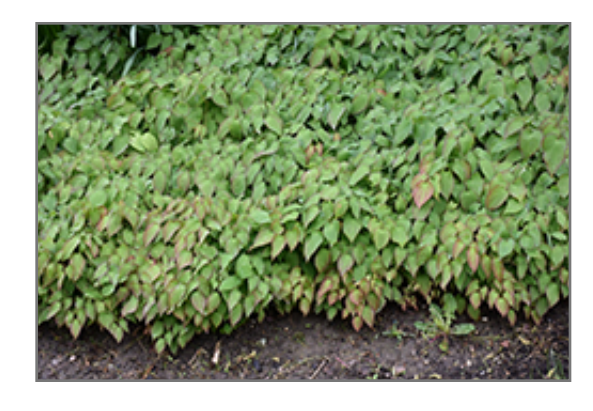
Bishop's Hat

Bishop's Hat is a fine choice for the garden, but it is also a good selection for planting in outdoor pots and containers. Because of its spreading habit of growth, it is ideally suited for use as a 'spiller' in the 'spiller-thriller-filler' container combination; plant it near the edges where it can spill gracefully over the pot. Note that when growing plants in outdoor containers and baskets, they may require more frequent waterings than they would in the yard or garden.