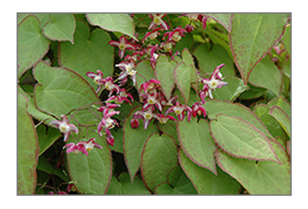
Bishop's Hat flowers

Bishop's Hat is a dense herbaceous evergreen perennial with a ground-hugging habit of growth. Its relatively fine texture sets it apart from other garden plants with less refined foliage.