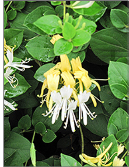
Hall's Japanese Honeysuckle flowers

Hall's Japanese Honeysuckle is recommended for the following landscape applications;