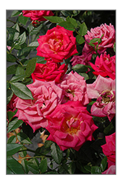
Be My Baby Rose flowers