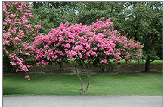
Crapemyrtle in bloom