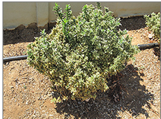
Variegated Boxleaf Japanese Euonymus