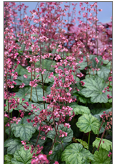
Berry Timeless Coral Bells flowers