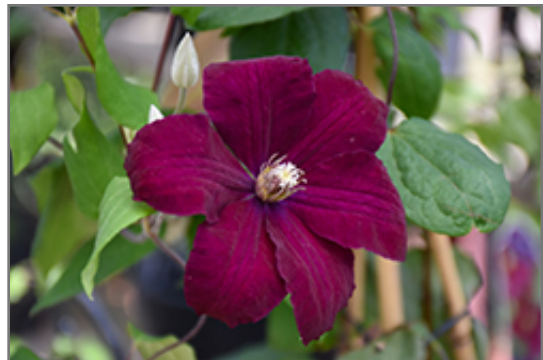
Rouge Cardinal Clematis flowers