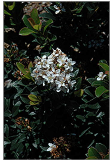
Snow White Indian Hawthorn flowers