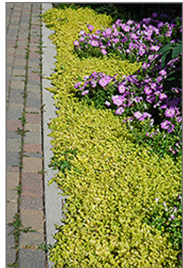
Golden Creeping Jenny