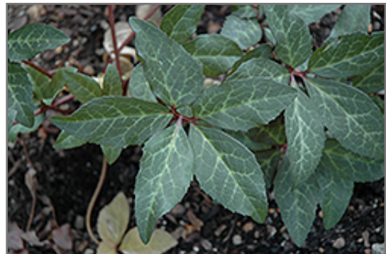
Merlin Hellebore foliage