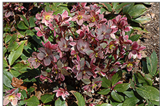
Pink Frost Hellebore in bloom