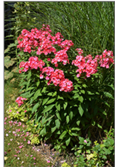
Flame Coral Garden Phlox in bloom