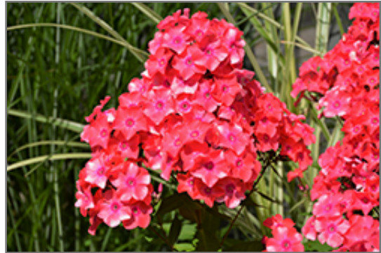
Flame Coral Garden Phlox flowers

This plant will require occasional maintenance and upkeep, and should be cut back in late fall in preparation for winter. It is a good choice for attracting butterflies and hummingbirds to your yard. Gardeners should be aware of the following characteristic(s) that may warrant special consideration;