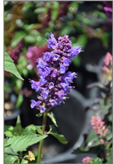
Blue Boa Hyssop flowers

Blue Boa Hyssop is a fine choice for the garden, but it is also a good selection for planting in outdoor pots and containers. With its upright habit of growth, it is best suited for use as a 'thriller' in the 'spiller-thriller-filler' container combination; plant it near the center of the pot, surrounded by smaller plants and those that spill over the edges. Note that when growing plants in outdoor containers and baskets, they may require more frequent waterings than they would in the yard or garden.