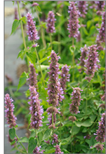
Blue Boa Hyssop flowers

Blue Boa Hyssop is recommended for the following landscape applications;