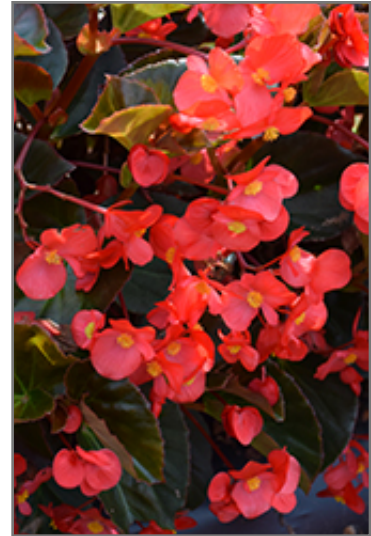
Big Red Bronze Leaf Begonia flowers

Big Red Bronze Leaf Begonia is a fine choice for the garden, but it is also a good selection for planting in outdoor containers and hanging baskets. It is often used as a 'filler' in the 'spiller-thriller-filler' container combination, providing a mass of flowers and foliage against which the larger thriller plants stand out. Note that when growing plants in outdoor containers and baskets, they may require more frequent waterings than they would in the yard or garden.