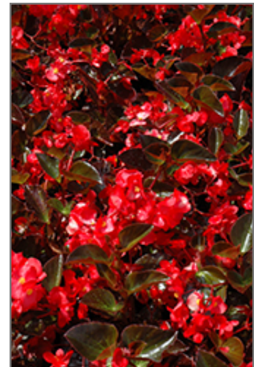
Big Red Bronze Leaf Begonia flowers