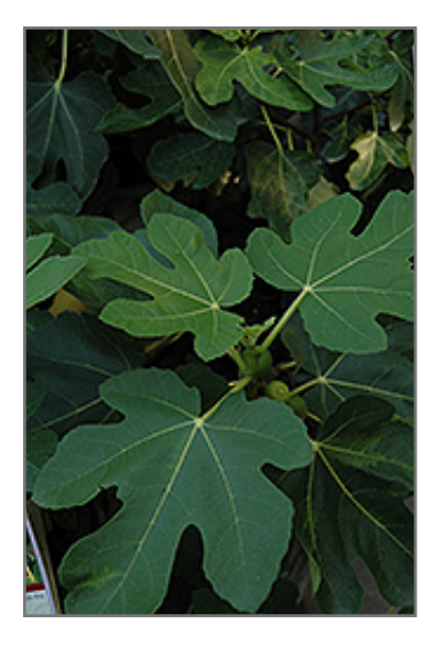
Mission Fig foliage