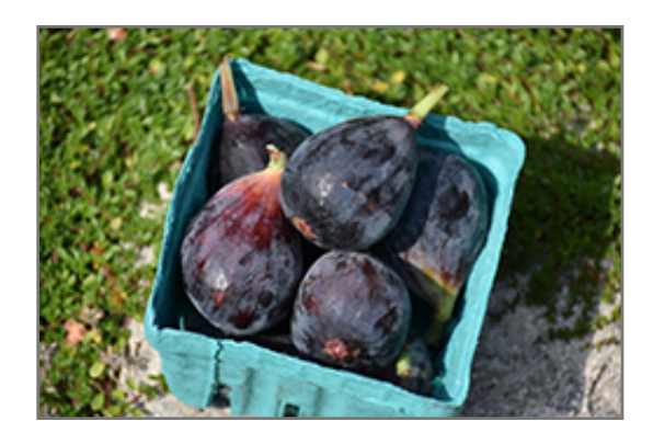
Mission Fig fruit

Mission Fig has attractive dark green foliage with chartreuse veins on a tree with a round habit of growth. The lobed leaves are highly ornamental but do not develop any appreciable fall color. The fruits are showy plum purple pomes carried in abundance in late summer. The fruit can be messy if allowed to drop on the lawn or walkways, and may require occasional clean-up.