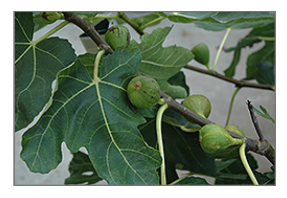
Mission Fig fruit