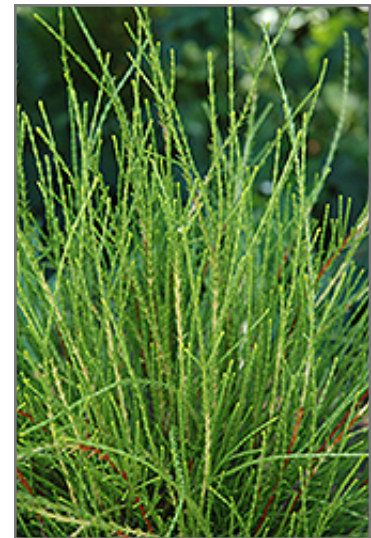
Franky Boy Arborvitae foliage