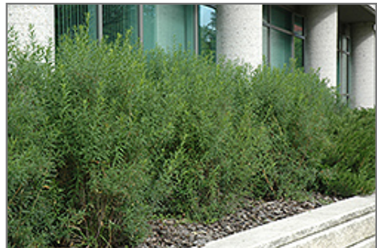
Dwarf Turkestan Burning Bush