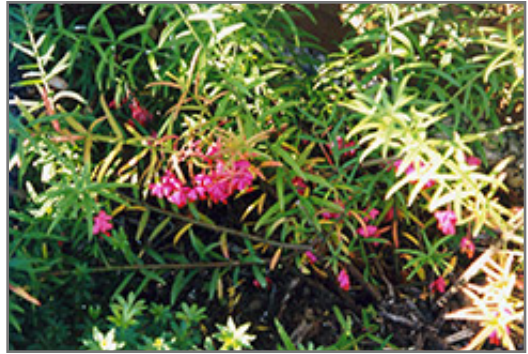
Dwarf Turkestan Burning Bush flowers

This shrub performs well in both full sun and full shade. It is very adaptable to both dry and moist locations, and should do just fine under typical garden conditions. It may require supplemental watering during periods of drought or extended heat. It is not particular as to soil type or pH. It is highly tolerant of urban pollution and will even thrive in inner city environments. This is a selected variety of a species not originally from North America.