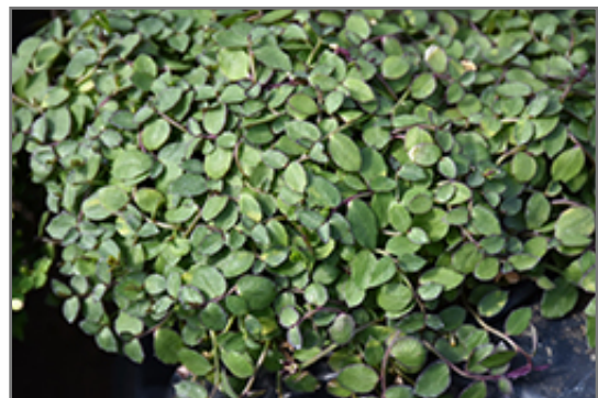
County Park Star Creeper foliage