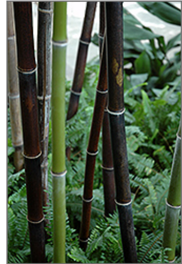
Black Bamboo bark