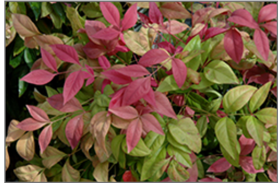
Blush Pink Nandina foliage

Blush Pink Nandina is recommended for the following landscape applications;