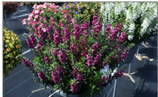
Archangel Raspberry Angelonia in bloom