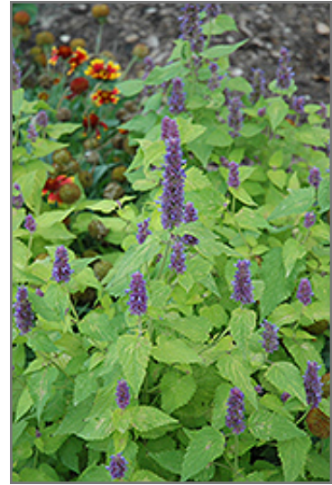
Golden Jubilee Anise Hyssop flowers

Golden Jubilee Anise Hyssop is a dense herbaceous perennial with an upright spreading habit of growth. Its medium texture blends into the garden, but can always be balanced by a couple of finer or coarser plants for an effective composition.