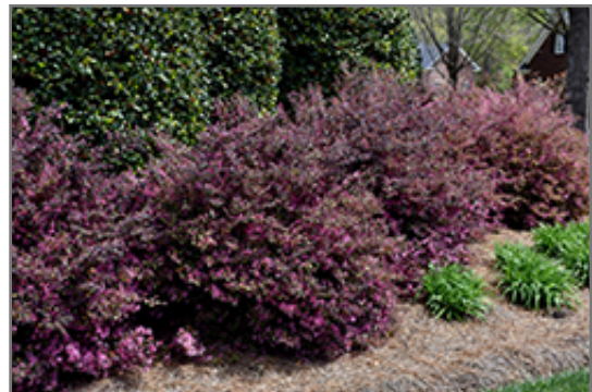
Purple Diamond Fringeflower in bloom