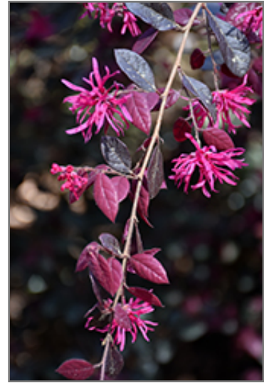
Purple Diamond Fringeflower flowers

Purple Diamond Fringeflower is recommended for the following landscape applications;