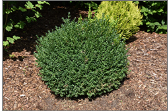
North Star Boxwood