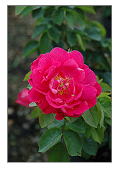
Party Hardy Rose flowers