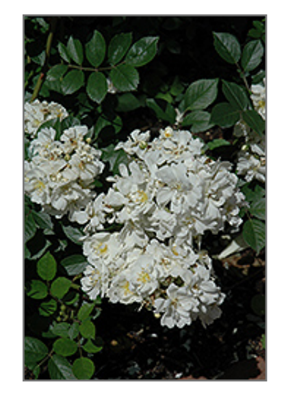
Gourmet Popcorn Rose flowers