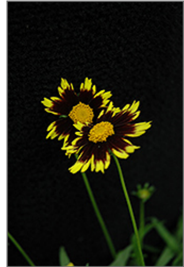
Cosmic Eye Tickseed flowers

Cosmic Eye Tickseed is recommended for the following landscape applications;