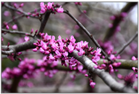
Burgundy Hearts Redbud flowers