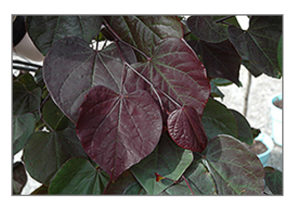
Burgundy Hearts Redbud foliage

Burgundy Hearts Redbud will grow to be about 25 feet tall at maturity, with a spread of 30 feet. It has a low canopy with a typical clearance of 3 feet from the ground, and is suitable for planting under power lines. It grows at a medium rate, and under ideal conditions can be expected to live for 60 years or more.