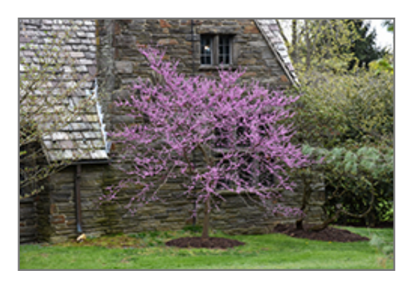
Burgundy Hearts Redbud in bloom