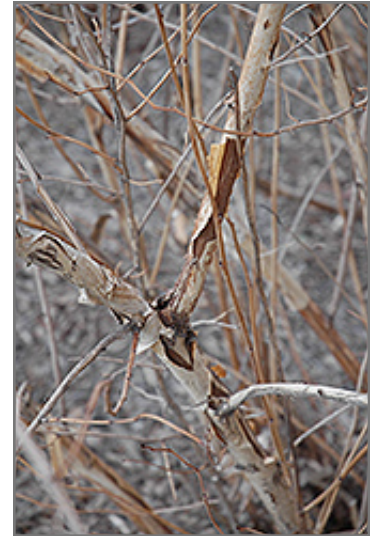
Diablo Ninebark bark

This shrub does best in full sun to partial shade. It is very adaptable to both dry and moist locations, and should do just fine under average home landscape conditions. It may require supplemental watering during periods of drought or extended heat. It is not particular as to soil type or pH. It is highly tolerant of urban pollution and will even thrive in inner city environments. This is a selection of a native North American species.