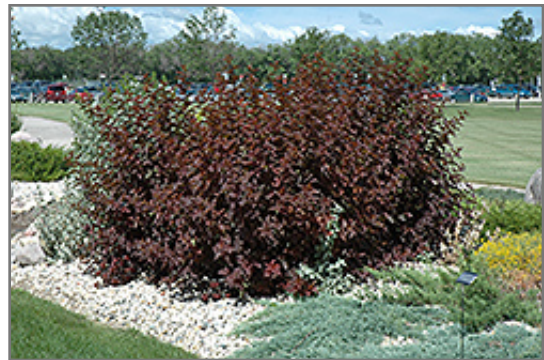
Diablo Ninebark