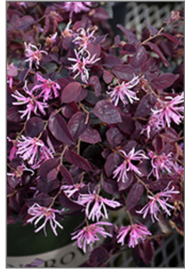
Sizzling Pink Chinese Fringeflower flowers