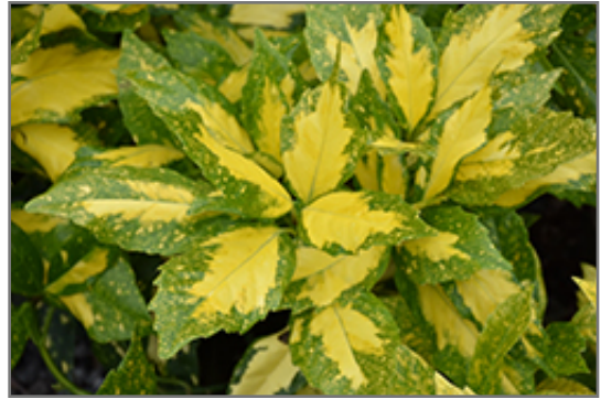
Picturata Aucuba foliage