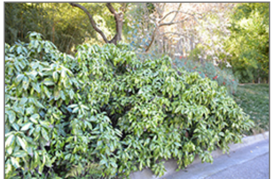
Picturata Aucuba