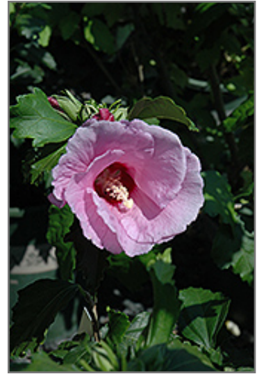
Minerva Rose of Sharon flowers

Minerva Rose of Sharon is recommended for the following landscape applications;