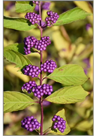
Japanese Beautyberry fruit

Japanese Beautyberry is recommended for the following landscape applications;