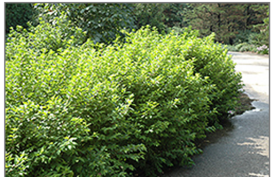
Japanese Beautyberry