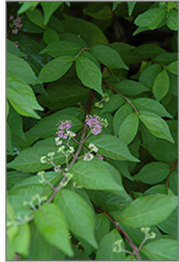
Japanese Beautyberry flowers

This shrub does best in full sun to partial shade. It is very adaptable to both dry and moist locations, and should do just fine under average home landscape conditions. It may require supplemental watering during periods of drought or extended heat. It is not particular as to soil type or pH. It is highly tolerant of urban pollution and will even thrive in inner city environments. This species is not originally from North America.