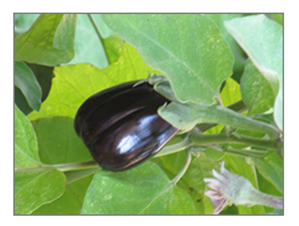
Black Beauty Eggplant fruit