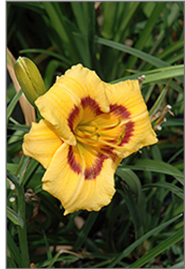
Kokomo Sunset Daylily flowers