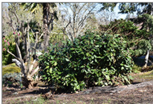
Ebbing's Silverberry