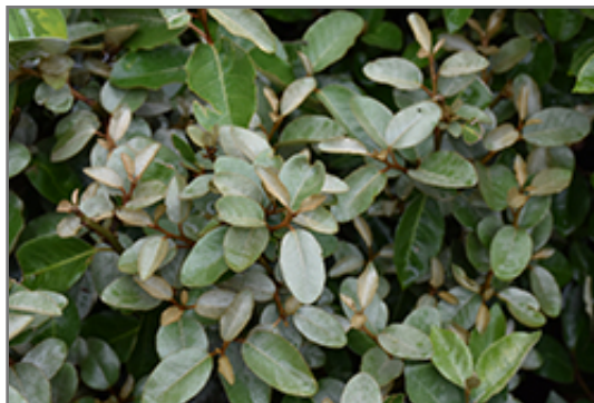
Ebbing's Silverberry foliage