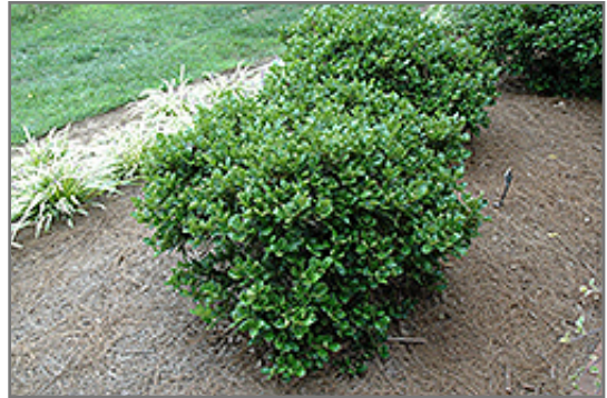
Carissa Holly

Carissa Holly is recommended for the following landscape applications;