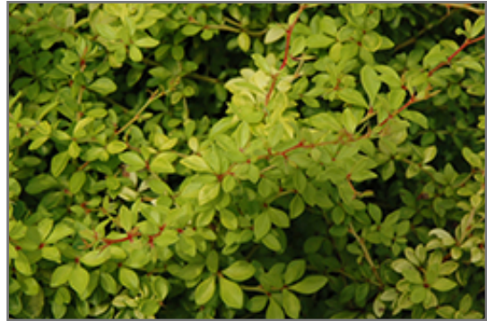
Golden Dream Japanese Barberry foliage

Golden Dream Japanese Barberry is recommended for the following landscape applications;