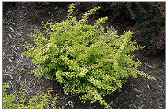
Golden Dream Japanese Barberry Photo courtesy of NetPS Plant Finder