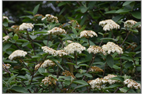
Alleghany Viburnum flowers

Alleghany Viburnum is recommended for the following landscape applications;