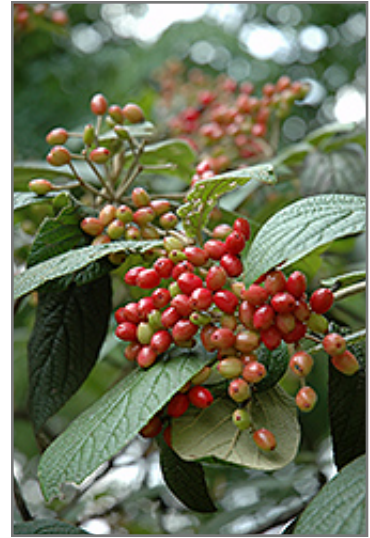
Alleghany Viburnum fruit

This shrub does best in full sun to partial shade. It prefers to grow in average to moist conditions, and shouldn't be allowed to dry out. It may require supplemental watering during periods of drought or extended heat. It is not particular as to soil type or pH. It is highly tolerant of urban pollution and will even thrive in inner city environments. This particular variety is an interspecific hybrid.