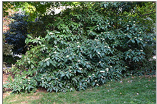
Alleghany Viburnum in bloom