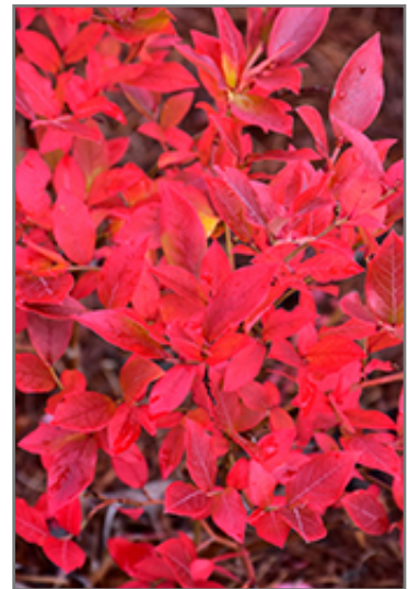
Chippewa Blueberry in fall