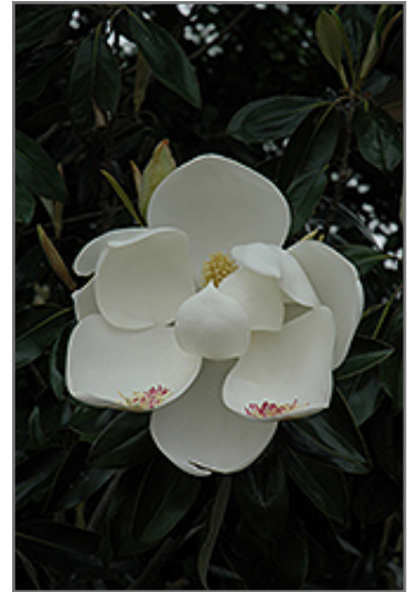
Teddy Bear Magnolia flowers