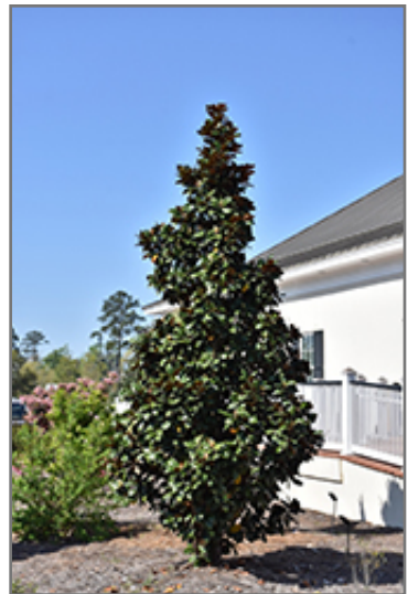
Teddy Bear Magnolia